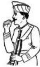
A sepoy bites open the cartridge