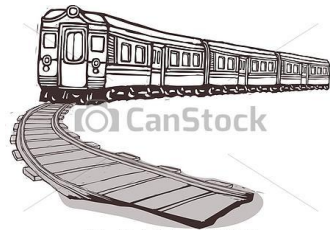
© Can Stock Photo - csp16087912